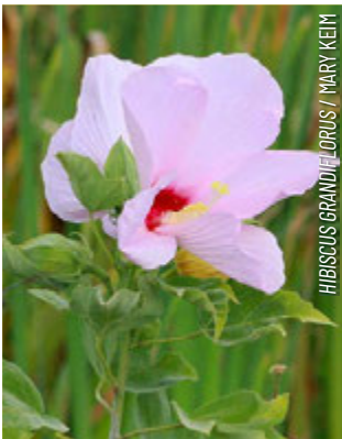
HIBISCUS GRANDIFLORUS