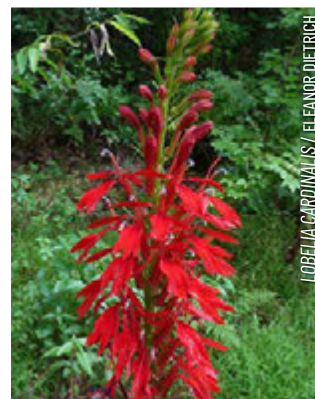
LOBELIA CARDINALIS / ELEANOR DIETRICH

Retention ponds with steep sides may pose planting challenges due to drainage patterns. Determining the average water level is critical for successful plant establishment. Avoid excessive plantings that prevent the pond from achieving its purpose of controlling water runoff. Before planting, check county and local policies for planting in stormwater management ponds.