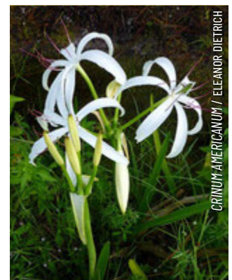
CRINUM AMERICANUM / ELEANOR DIETRICH